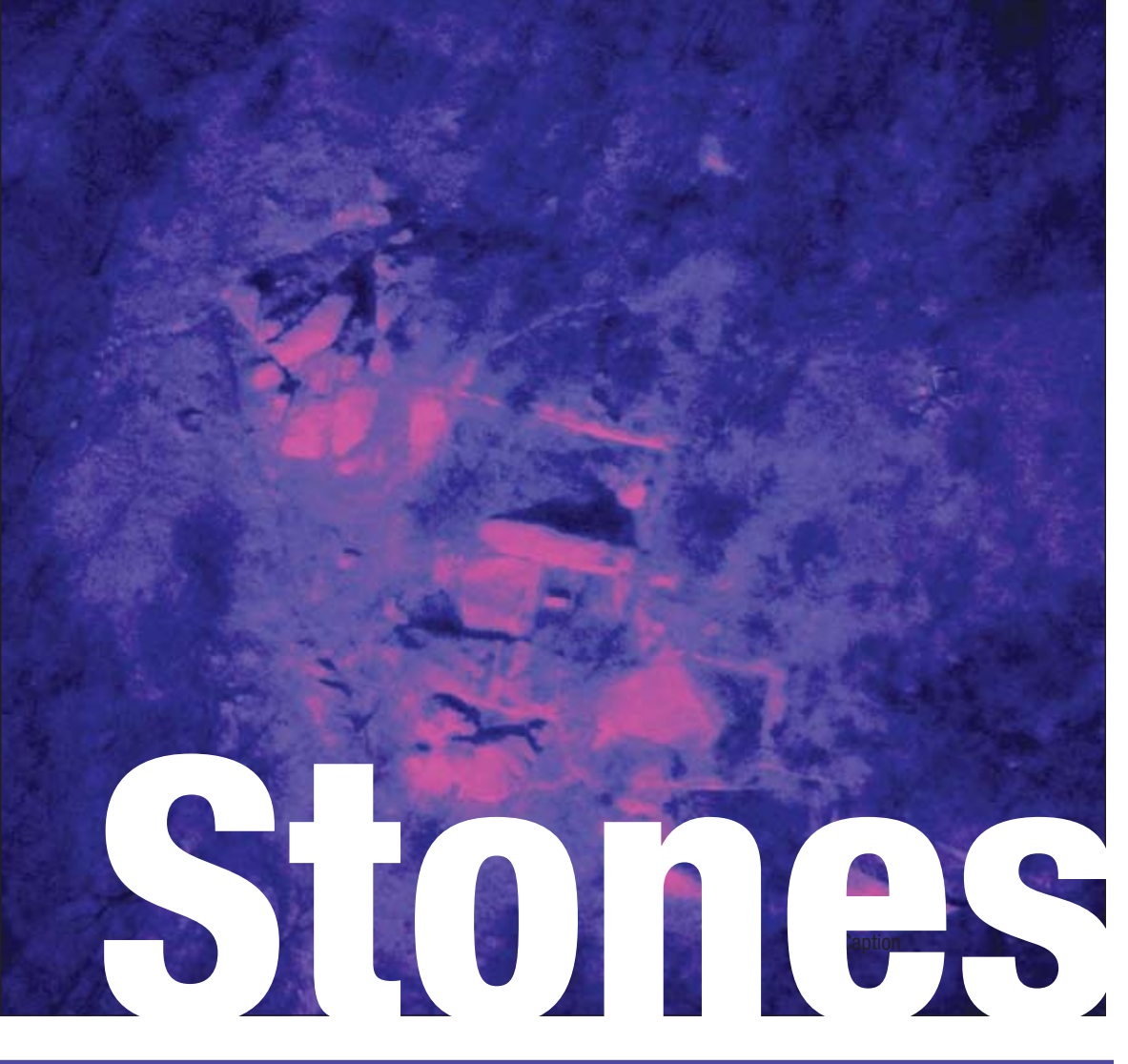
LEFT: The hive stones were captured using two types of ultraviolet light with an experimental camera.